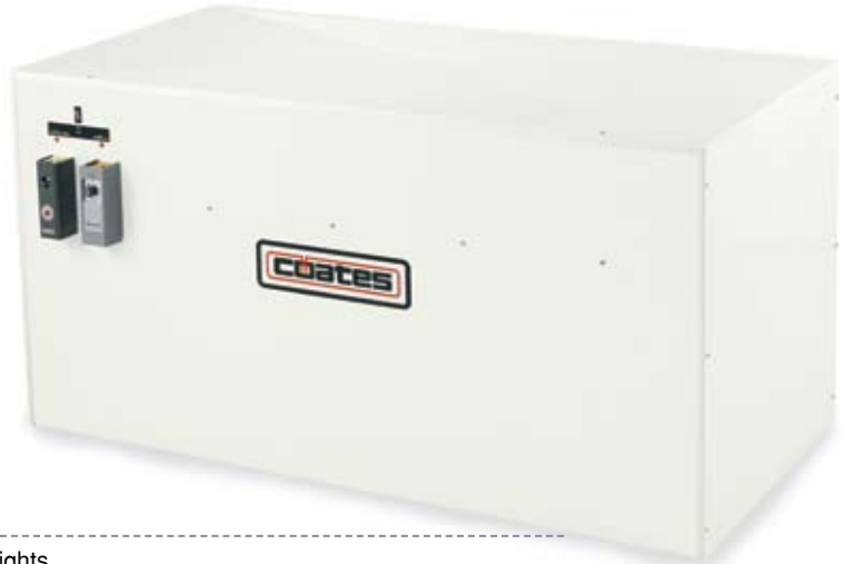
PHS-20 THREE PHASE

All electrical components are easily accessible under the conveniently hinged cover. Terminal blocks are provided for simplified power supply wiring.