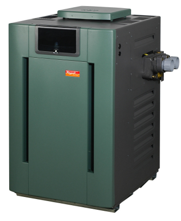
Digital model with outdoor top shown