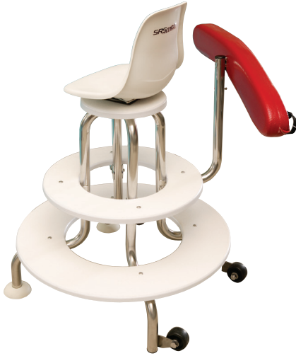
42" O-Series Lifeguard Chair