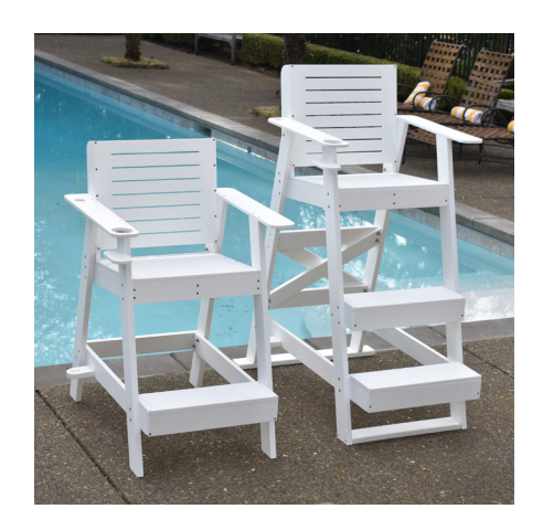
Sentry<sup>™</sup> 30" and 42" seat height lifeguard chairs

Designed to complement any aquatic environment, Sentry™ lifeguard chairs provide an elegant look that will stand the test of time. Constructed from high-density polyethylene (HDPE) and 316 marine grade stainless steel hardware they are strong, durable and low maintenance.