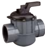
263029 • 2-way 2" x 2½" PVC 263038 • 2-way 1½" x 2" PVC