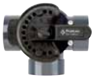
263028 • 3-way 2" x 2½" PVC 263037 • 3-way 1½" x 2" PVC