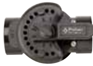
263027 • 2-way 2" x 2½" CPVC 263036 • 2-way 1½" x 2" CPVC