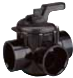
263026 • 3-way 2" x 2½" CPVC 263035 • 3-way 1½" x 2" CPVC

Pentair valves offer dependable, lubrication-free performance for less. Engineered for long life, they outperform other manufacturers' higher priced valves. Ask your sales representative for pricing.