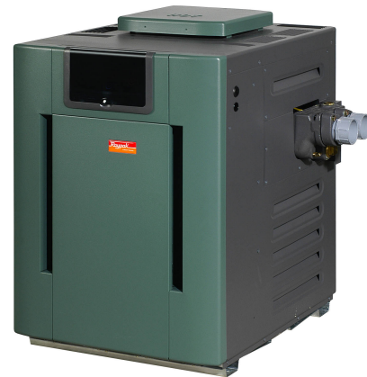
Shown with outdoor top