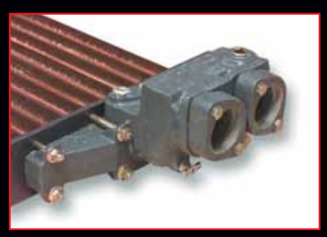
Cast iron headers