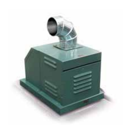
D-2 Power Vent

Using the Raypak-supplied adjustable 90° elbow, the flue gases may be discharged in any direction (see D-2 Power Vent manual for details). The D-2 Power Vent is also dual-voltage capable (120/240 volt) and engineered for long life and smooth operation.