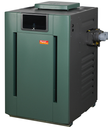
Digital model with outdoor top shown