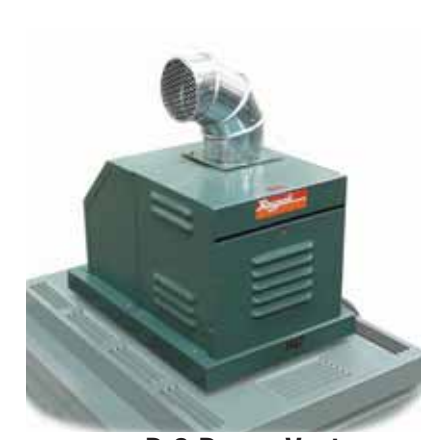
D-2 Power Vent

Using the Raypak-supplied adjustable 90° elbow, the flue gases may be discharged in any direction (see D-2 Power Vent manual for details). The D-2 Power Vent is also dual-voltage capable (120/240 volt) and engineered for long life and smooth operation.