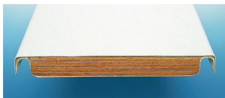
Frontier III Commercial