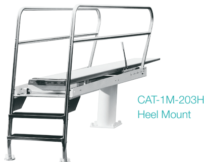
CAT-1M-203H Heel Mount