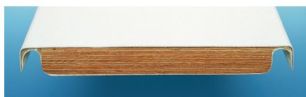
Frontier III Commercial