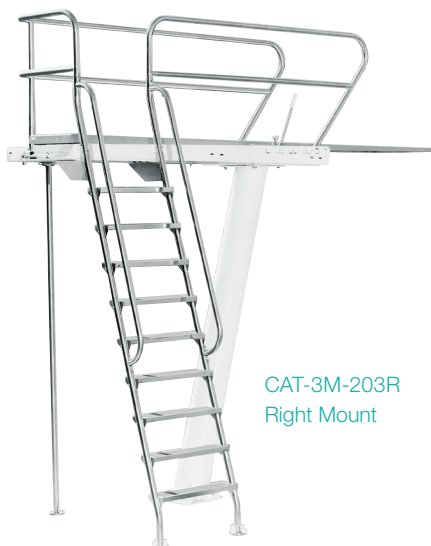
CAT-3M-203R Right Mount